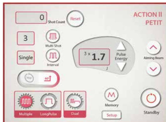
Figure 3 Petit Lady GUI

For example, I believe that the combination of multiple micropulses and long pulse accelerates tightening of the vaginal wall. Responses from my patients are also great.'